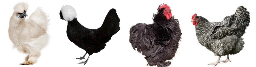
Chinese Silkie Polish Chicken Frizzle Bantam Plymouth Rock