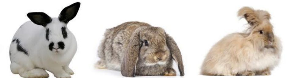
English Spot Rabbit Dwarf Lop Rabbit Angora Rabbit